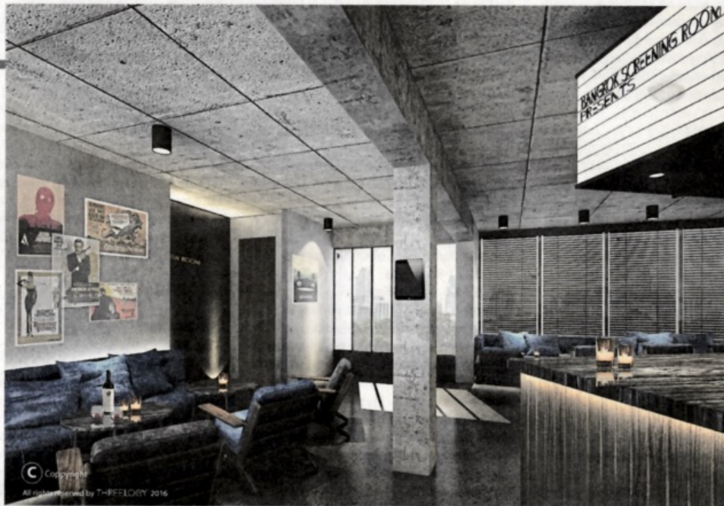
Bangkok Screening Room.