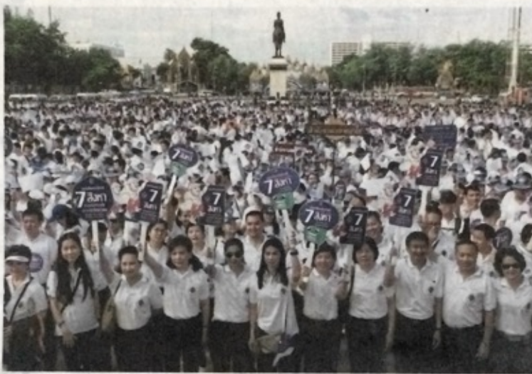
People from all walks of life join the Election Commission's 'Big Day' activity aimed at drumming up public attention and getting people out to write in Sunday's referendum on the draft constitution at the Royal Plaza.

Though it is not the party's resolution, Mr Abhisit's stance is in line with the principle of democracy, for the country changed to democracy 84 years ago, so we cannot afford to step backwards, but we must move forwards," Mr