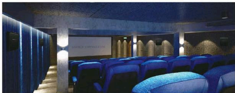
A 3D rendition of the inside of the BKKSr cinema, right, and the lounge, above.