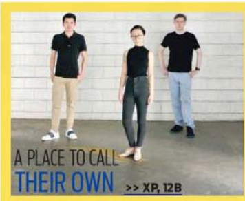
A PLACE TO CALL THEIR OWN >> XP, 12B