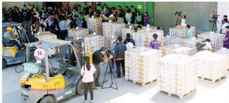
Media representatives observe the printing and transport of ballot papers to be used in the August 7 referendum at a well-guarded printing house in Samut Prakan's Phra Padaeng district, in a trip organised by the Election Commission yesterday. About 54.6 million ballot papers are due to be printed by Thursday.