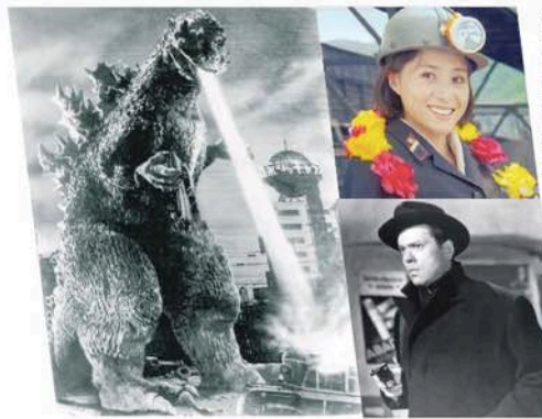
The BKKSr will open with the North Korean comedy "Comrade Kim Goes Flying", left, and follow up with independent and classic films like the original "Godzilla", far left, and "The Third Man", below left.